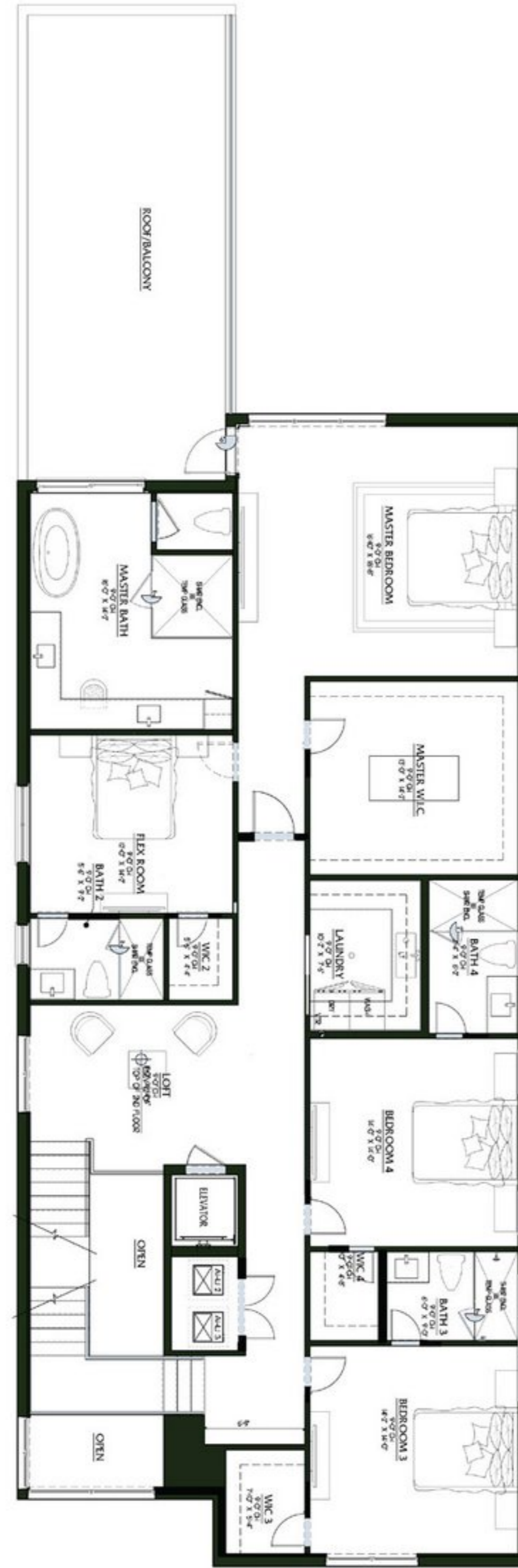
SECOND FLOOR FLOOR PLAN