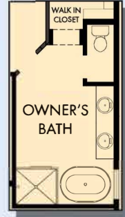
OPTIONAL FREE-STANDING TUB WITH SEPARATE SHOWER AT OWNER'S BATH