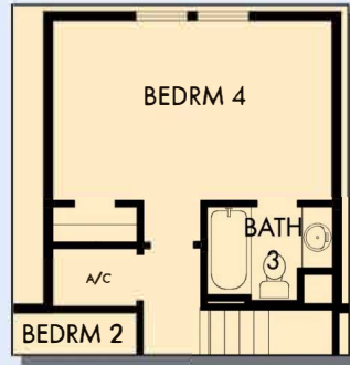
OPTIONAL BEDROOM 4 WITH BATH 3 AT RETREAT