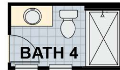
OPT. SHOWER ILO TUB