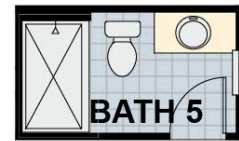
OPT. SHOWER ILO TUB