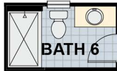
OPT. SHOWER ILO TUB