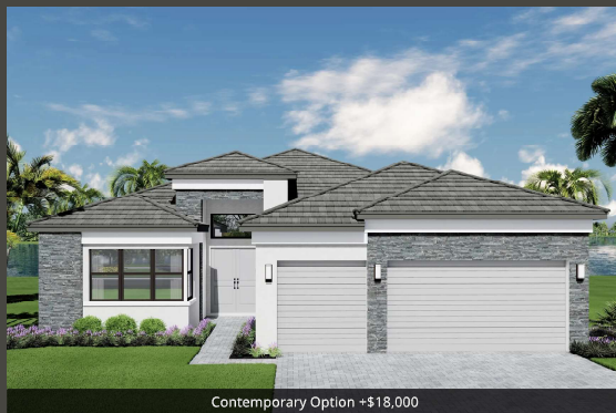
Contemporary Option +$18,000