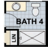
OPT. SHOWER ILO TUB