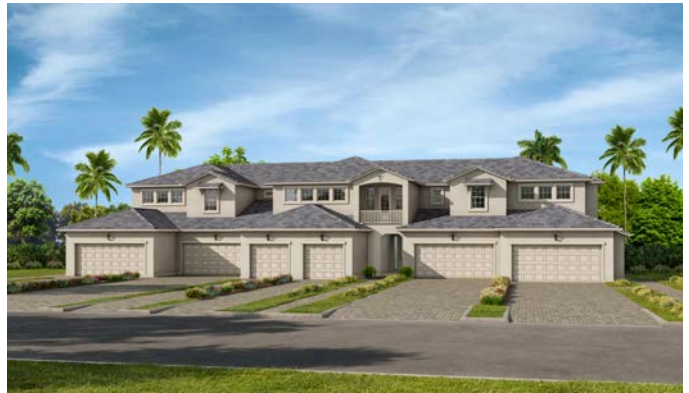
Elevation West Indies

All renderings and graphics are artist's concept only for illustration, and are not part of a legal document. Mattamy reserves the right to make changes to these floorplans, specifications, dimensions and elevations without prior notice. These floor plans, room dimensions and exterior foot prints only apply to elevation "Craftsman" as far as listed base price and specifications. Note that plan square footages and room dimensions may vary according to elevation and options selected. Plan may be built as the mirror image. Flooring illustrations are used to show area of flooring, actual flooring type is specified on the Community Feature Sheet. Please consult your New Home Counselor for more details. E.&O.E. November 2018. Copyright 2018 - Mattamy Homes Limited. Builder License # CGC1524054.