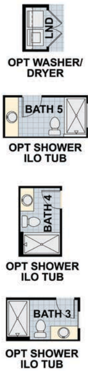
FIRST FLOOR A