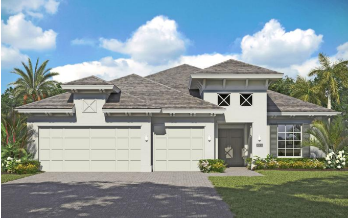
West Indies elevation

Bed: 3 Den: Living SqFt: 2,610 Bath: 3 Garage: 3 Total SqFt: 3,517