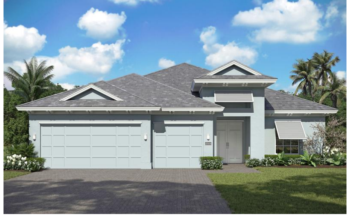
Florida Coastal elevation